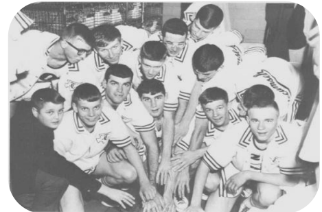
1965-66 Team Celebrating After Holiday Tournament Victory