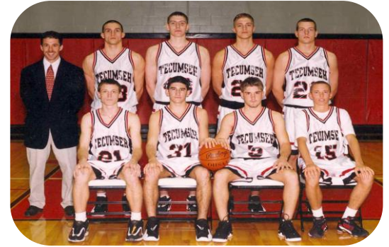
1999-2000 TECUMSEH ARROWS